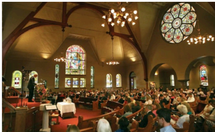
The congregation of First Presbyterian Church celebrates the church's 125th anniversary Sunday.

The building was raised, stone by stone, by the original members of the congregation as a sign of their personal commitment to God and to the mission of the Church in spreading the Good News of Jesus Christ. Let us treasure our history and work to sustain our sense of family into the future.