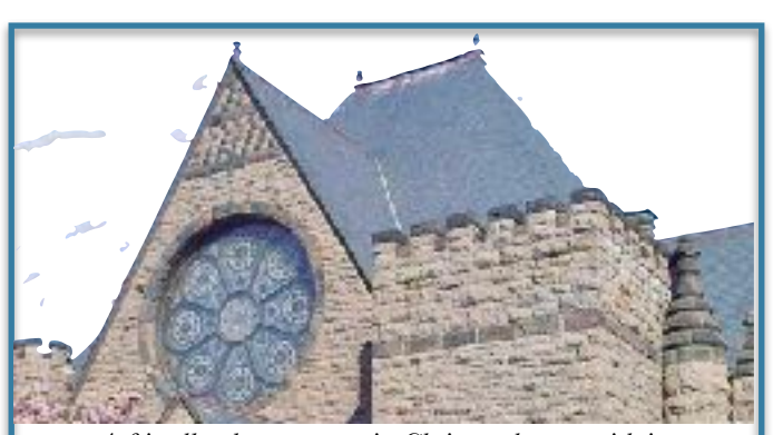
A friendly place to grow in Christ and serve with joy