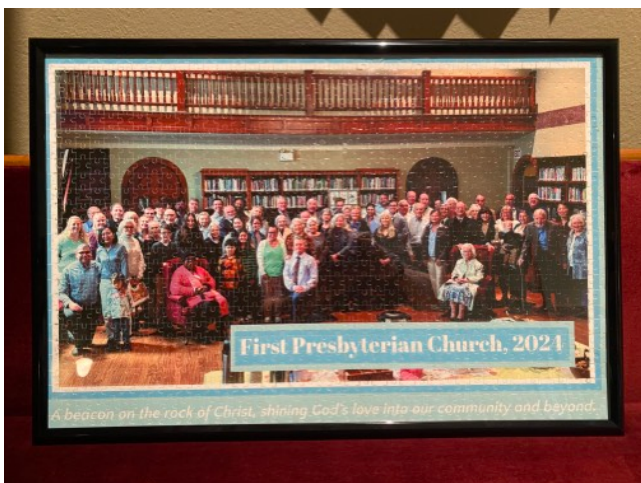
The puzzle is complete!

Sunday's flowers were lovingly given by anonymous donors.