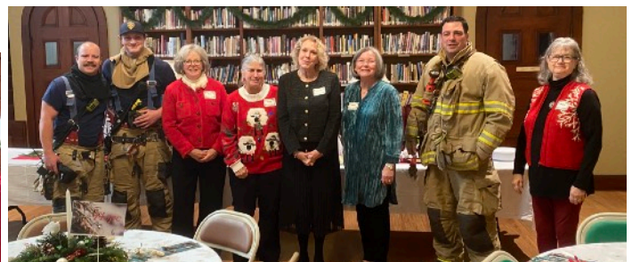
A small kitchen mishap led to a visit from the Newport Fire Department, who kindly posed with the set-up crew after declaring all was safe and sound.